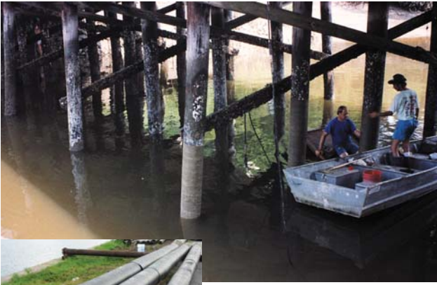
SeaShield Series 90 consists of Premtape Marine preventing marine borer destruction and an outcover for mechanical protection of tape.