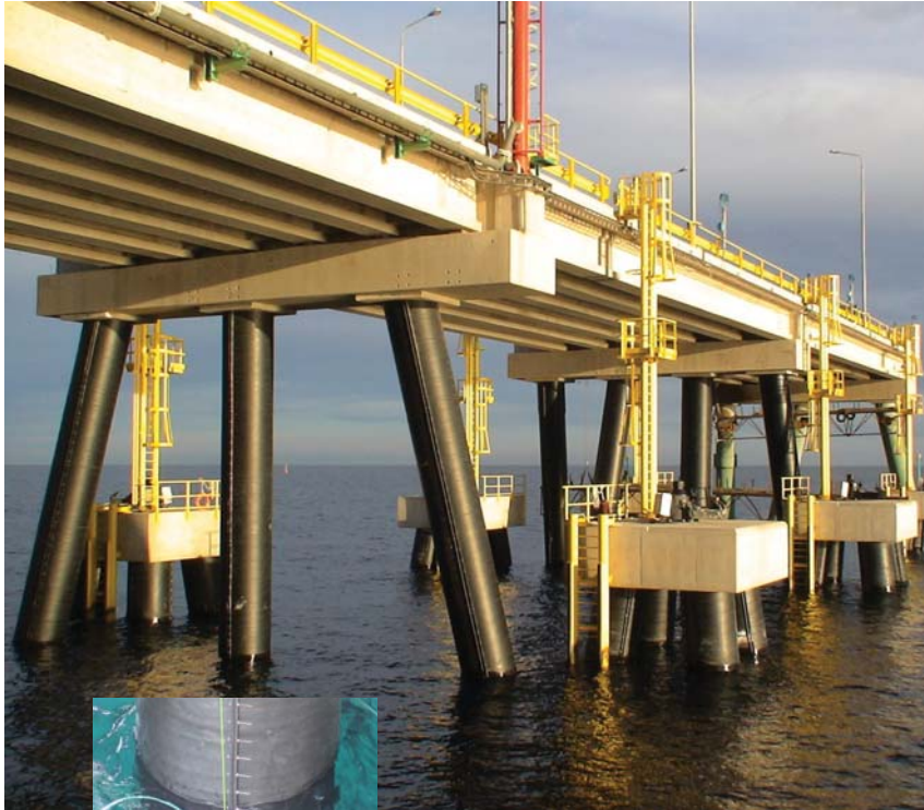
SeaShield Series 2000FD System designed to withstand the most aggressive environments.