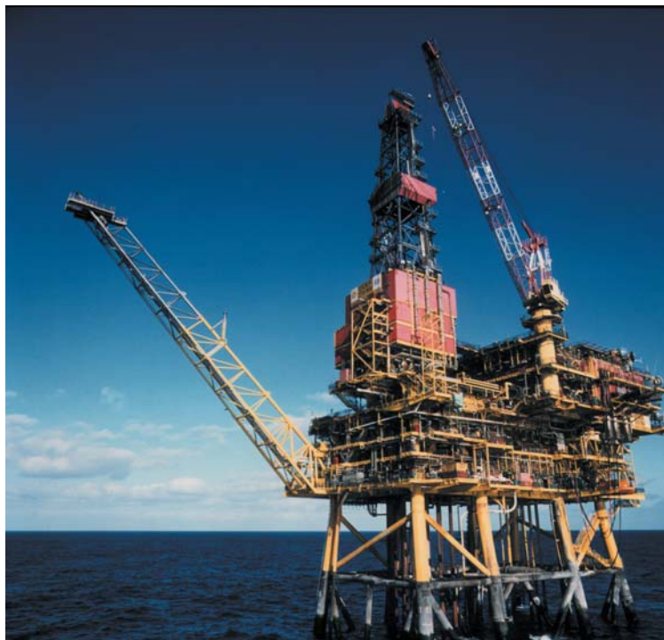
Premier Rigspray can be used on offshore rigs and structures to protect areas subjected to high corrosion.