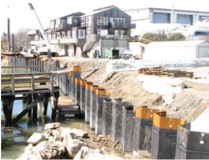
Side view showing initial phase of the Boston Marina using Premier Rigspray steel sheet piles.