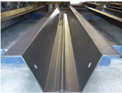
New sheet pile just after Premier Rigspray was applied (55" wide x 45' long weighing over 6,000 lbs.).