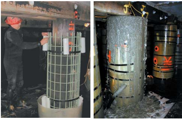
Structurally repaired timber piles with rebar, concrete and translucent SeaShield Fiber-Form fiberglass jackets. The jackets can be manufactured to be translucent or gel coated to a color.