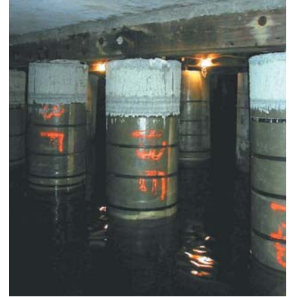
Structurally repaired timber piles with rebar, concrete and translucent SeaShield Fiber-Form fiberglass pile jackets.