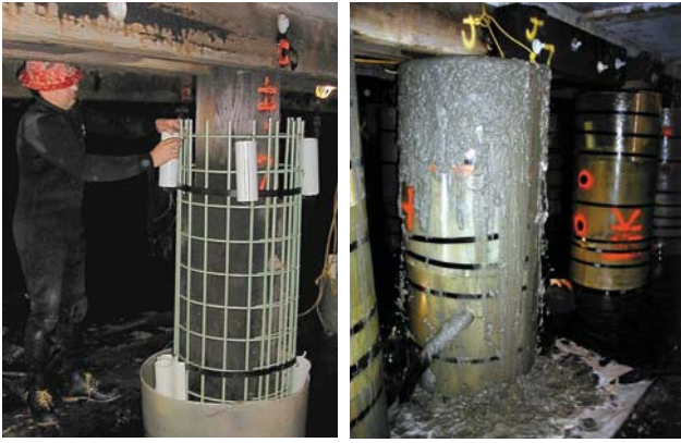
Structurally repaired timber piles with rebar, concrete and translucent SeaShield Fiber-Form fiberglass jackets. The jackets can be manufactured to be translucent or gel coated to a color.