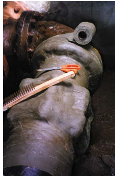
Complete corrosion protection of pipe, flange and coupling.