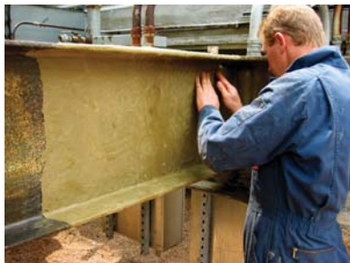
Petrolatum Tape system (Prembond Hi-Tack Tape) applied to structural steel.