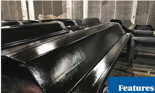
Protal 600 CTE provides long-term corrosion protection to steel sheet piles.