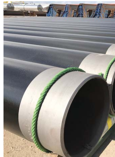
No primer is required when applying Protal 600 CTE.