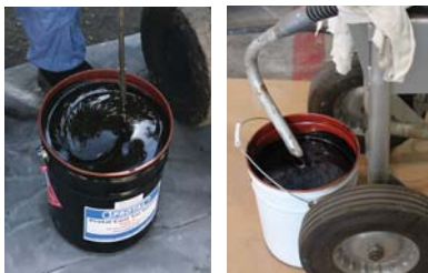
Protal 600 CTE is a two-part high build coal tar epoxy that is applied with a single leg airless unit.