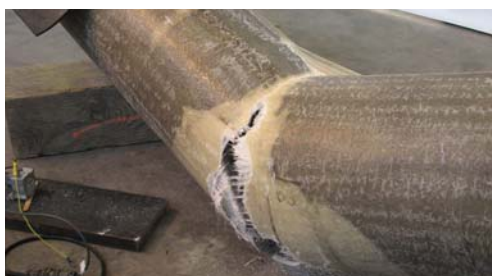
Completed bending test – all piles doubled in strength compared to the original unprotected piles.