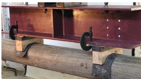
Bending test setup & actuator for the SeaShield Series 400.