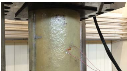
Compressive test setup.